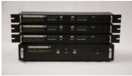
Precision Radiant Tester with Multiplexer

The MUX 2018 is its own stand-alone USB controlled instrument and can test hot or cold temperatures.