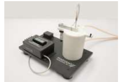
Non Heated Piezoelectric (Converse D33) Test Bundle for Bulk Ceramics

The Bulk Ceramic Piezoelectric Test Bundle is rated to 10kV. Allows piezoelectric displacements (converse d33 measurement) on the order of one micron or larger using Radiant Testers. Includes a Piezoelectric Displacement Sensor, Piezoelectric Measurement Test Fixture, and Advanced Piezoelectric Software. The Sample Chamber is rated to 10,000 Volts. The bundle's simple user interface is controlled by Radiant's fully automated Vision Data Acquisition Software. Converse D33 Measurements can be extracted using Vision Software.