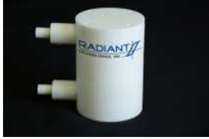
High Voltage High Temperature Test Fixture

Radiant offers several test fixtures that range from 230°C to 650°C rated to 10kV. These test fixtures can be used at room temperature, with silicon oil, or in a chamber or furnace.