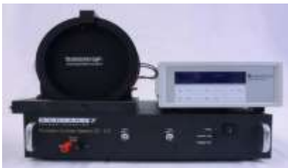
Radiant Tester with Magneto Test Bundle

Radiant's Magneto-electric Test Bundle allows users to set DC Magnetic Fields across a sample using any coil and adjust those fields while a test progresses under Vision Software.