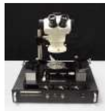
RTI-30 Fully Integrated Probe Station

RTI-30 Fully Integrated Probe station with optics for the research of advanced active and passive components. Binocular and Trinocular stereo zoom microscope with 20X magnification (Included wide field eyepieces), LED ring illuminator, precision x-y stage with isolated and shielded chuck, vacuum hold down and Z-lift. Hot Chucks quoted upon request.