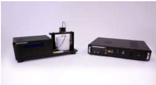
AutoCal230C Piezoelectric (Converse D33) Thermal Test Chamber

The AutoCal 230°C Piezoelectric Thermal Test Chamber Includes - Displacement Sensor, Heated Piezoelectric/Pyroelectric Measurement Test Fixture, Pyroelectric/Chamber and Advanced Piezoelectric Software. The Self-calibration will allow fully automatic temperature (to be internally heated to 230°C) profiles for both electrical and piezoelectric tests. The heating unit is built-in to the self-contained fixture, so no additional temperature chamber is necessary. The bundle's simple user interface is controlled by Radiant's fully automated Vision Data Acquisition Software. Converse D33 Measurements can be extracted using Vision Software