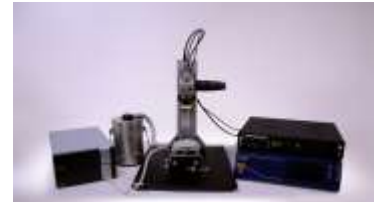
High Resolution Thermal- Angstrom-Level Measurement Platform-VibroOne & Thermal Stage