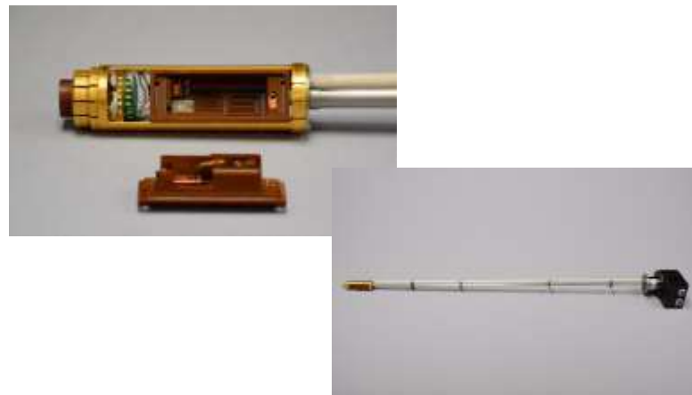
High Voltage Cryogenic Probe (HVCP) compatible with Quantum Design PPMS

Measurements above 1,200 volts up to 4,000 volts may be executed without breakdown if the chamber is placed in High Vacuum mode.