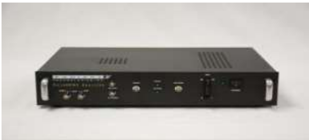
New Precision PiezoMEMS Analyzer